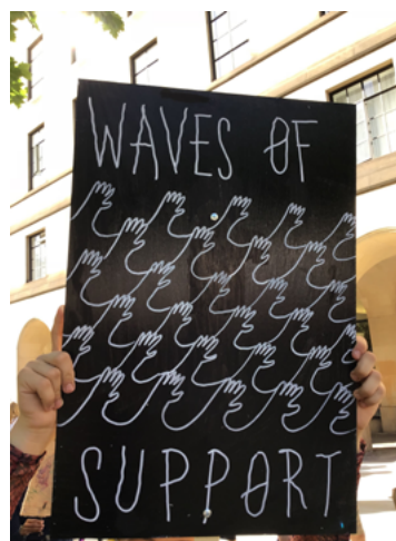
Illustration 2. “Waves of support” placard, Manchester, September 2019

Radical kindness among young environmental activists is an intersectional approach to what we referred to earlier as “system change”. Intersectionality is the theoretical approach that acknowledges the “need to account for multiple grounds of identity when considering how the social world is constructed” (Crenshaw 1991: 1 245) and reveals how structures of privilege and disadvantage interact to form a system of “interlocking oppressions” (Roberts 2012: 240). An intersectional analysis of climate change helps us to understand “how different individuals and groups relate differently to climate change, due to their situatedness in power structures based on context-specific and dynamic social categorisations” (Kaijser and Kronsell 2014: 417). One example of an intersectional approach – and one which examines the intersection of racialised inequality, economic inequality and the impact of environmental damage – is provided by Alexandra Wanjiku Kelbert (2016) in her analysis of why the Black Lives Matter movement blockaded, and closed, London City Airport in 2016.