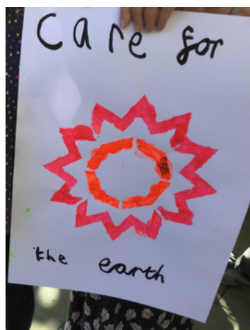
Illustration 3. “Care for the earth” placard, Manchester, September 2019

Young people’s environmentalism is, characteristically, a movement of care and kindness. Radical kindness, as we define it, means thinking about social change as a process of care for others. By “care”, we mean the practices of emotion, morality and empathy among young environmental activists. These practices frequently include the expression of love and consideration for others and emotions such as joy, fear and hope, and feature malleable and adaptive approaches to activism that benefit from a permeable public/private divide. Traditionally, academic work on political activism divides young people’s activism into “dichotomies of political instrumentality versus self-expression” (Bowman 2019: 302) and tends to “celebrate agency and view youth as isolated, bounded, individual subjects” (Wood 2020: 219). The activism of young people, in other words, is examined in terms of individual acts of political agency. These acts are separated into two categories. The first consists of political instrumentalist acts, namely things young activists do in order to achieve a political goal. The second consists of self-expressive acts, which are expressions of the self, of feeling, emotions and so forth. Radical kindness, as an ethics of care for others, challenges the traditional approach to young people’s activism in two ways.