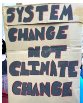
Illustration 1. “System change not climate change” placard, Manchester, September 2019

Young people’s environmental activism, including young people’s movements for action on climate change, 2 features a wide range of young people among its supporters and activists. They are global in nature and include young people of all ages (O’Brien, Selboe and Hayward 2018; Boulianne, Lalancette and Ilkiw 2020; Bowman 2020; Nissen, Wong and Carlton 2021). The young generation is not a monolithic or homogeneous group, and neither are young environmental activists. Academic work, including our interviews, shows that young people are motivated to participate in environmental movements for many different reasons (Pickard, Bowman and Arya 2020; Bowman 2020). However, there are features of young people’s environmental activism that differentiate young people as activists, and young people’s movements, from mainstream activists and mainstream environmental movements.